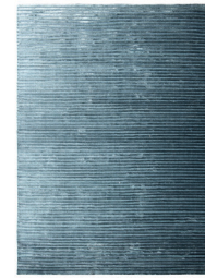
Midnight Blue 5855779