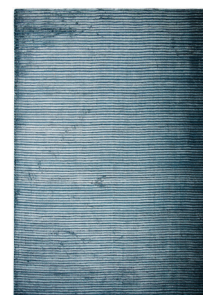
Midnight Blue 5856779