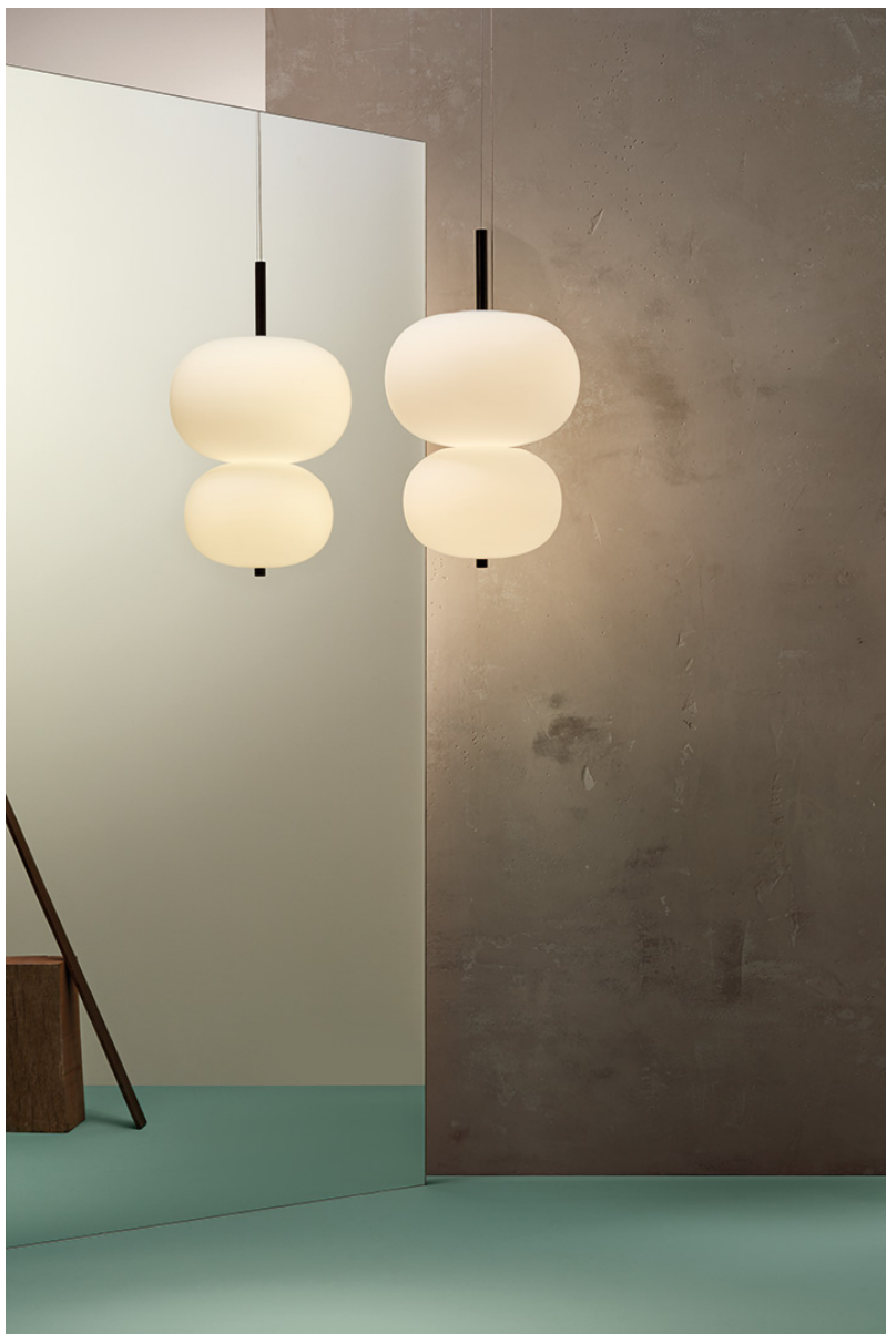
Image may not match reference. LedsC4 reserves the right to amend any of the product's components. The data related to flux, power and colour temperature may be subject to changes made by the manufacturer.