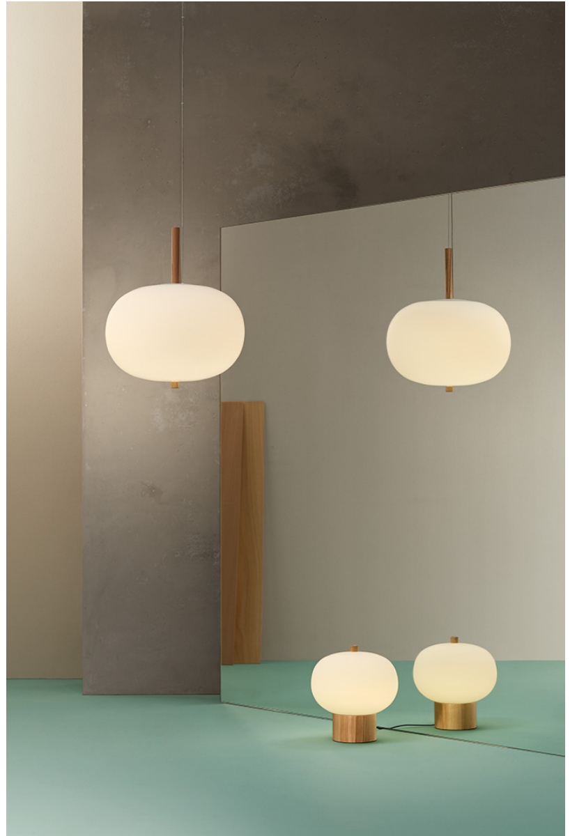
Image may not match reference. LedsC4 reserves the right to amend any of the product's components. The data related to flux, power and colour temperature may be subject to changes made by the manufacturer.