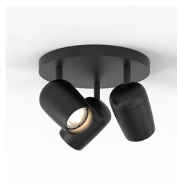
CODE: 1478005 FINISH: MATT BLACK