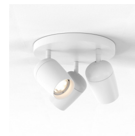
CODE: 1478013 FINISH: MATT WHITE

To maintain this product to its best condition, please view our care and cleaning guide on the support section of the astro website.