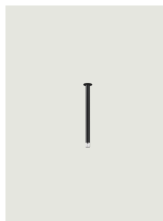
A-Tube Nano Swing small