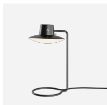
AJ Oxford Table Lamp