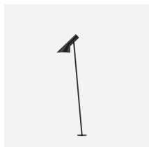
AJ Garden Bollard