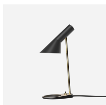
AJ Mini Table Lamp