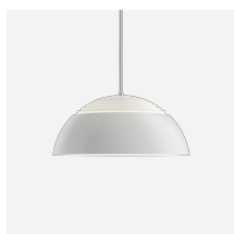
AJ Royal Pendant