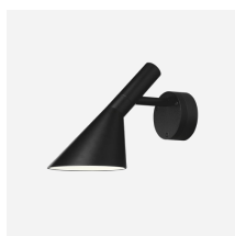
AJ 50 Outdoor Wall Lamp