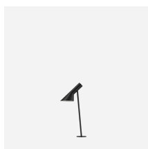
AJ Garden Bollard