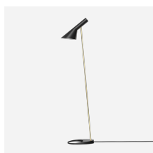
AJ Floor Lamp