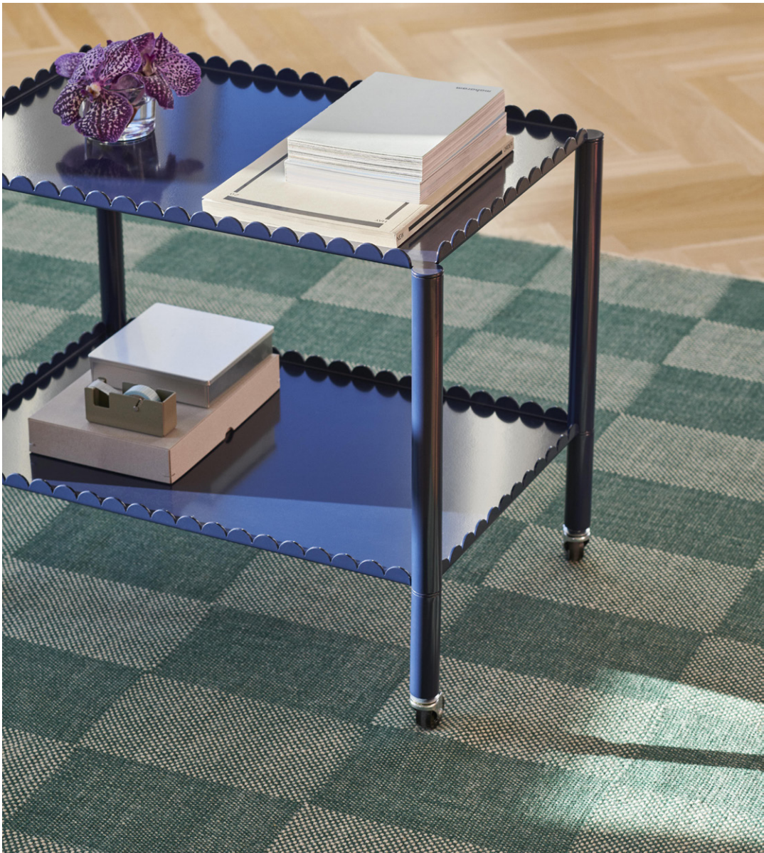
Arcs Trolley Low | Steel blue