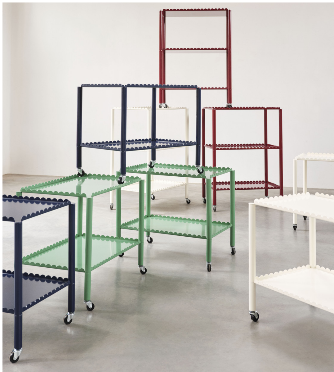
Arcs Trolley Family