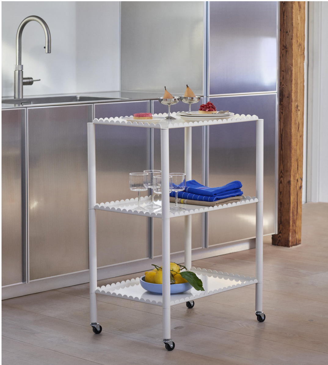
Arcs Trolley High | Eggshell