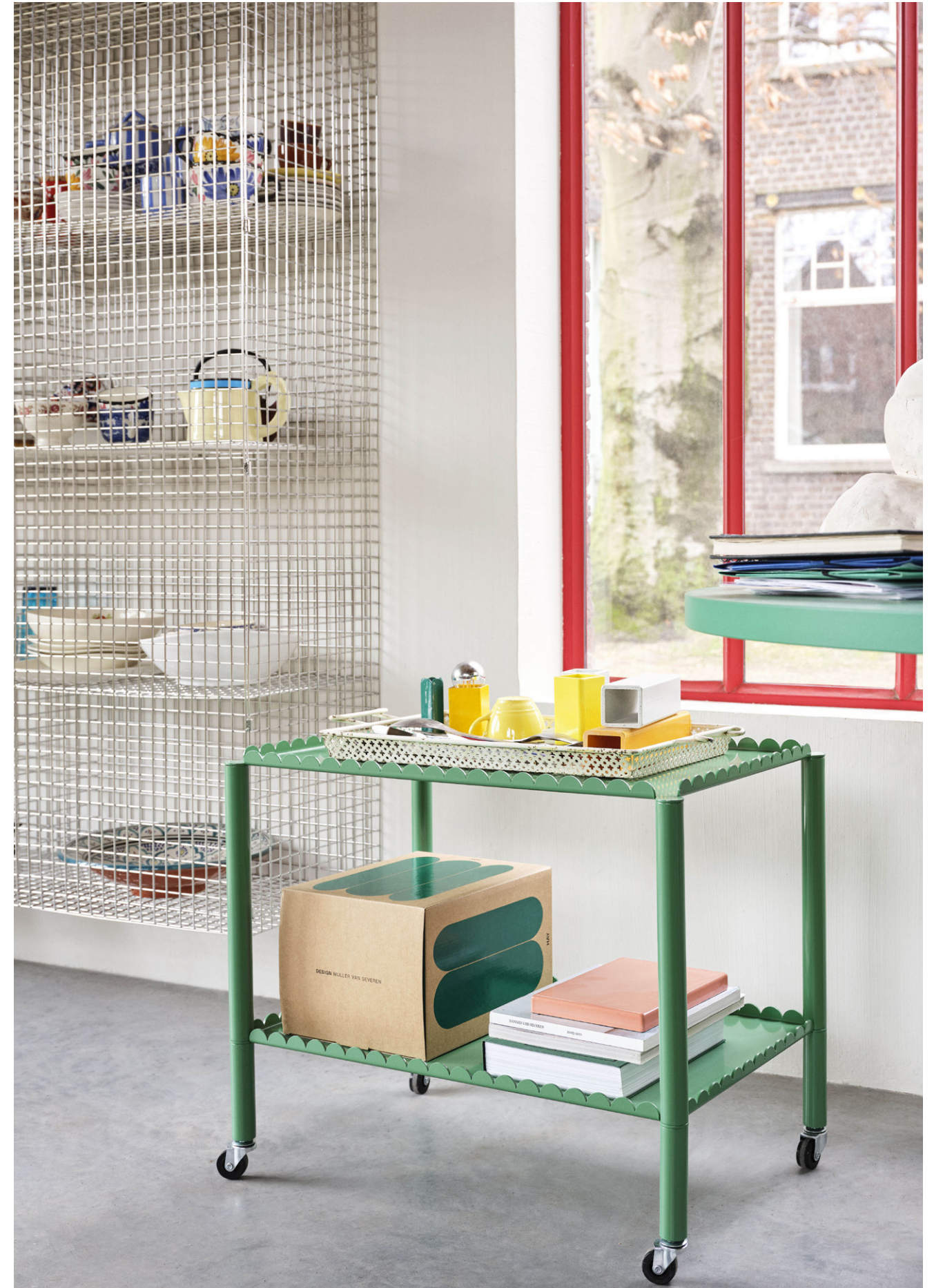
Arcs Trolley Low | Jade green