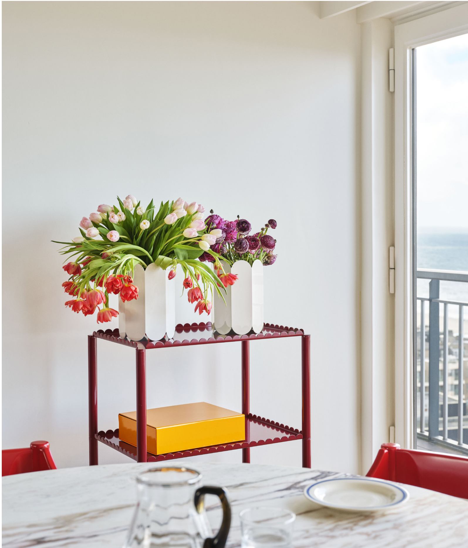
Arcs Trolley High | Auburn red