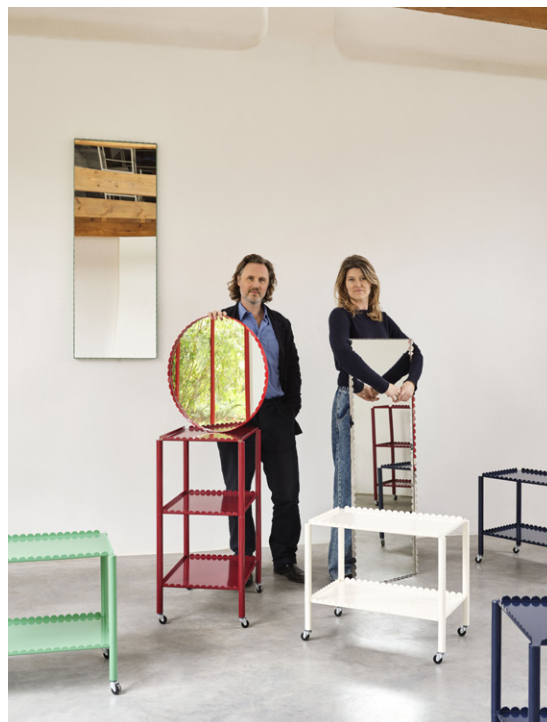
Muller Van Severen