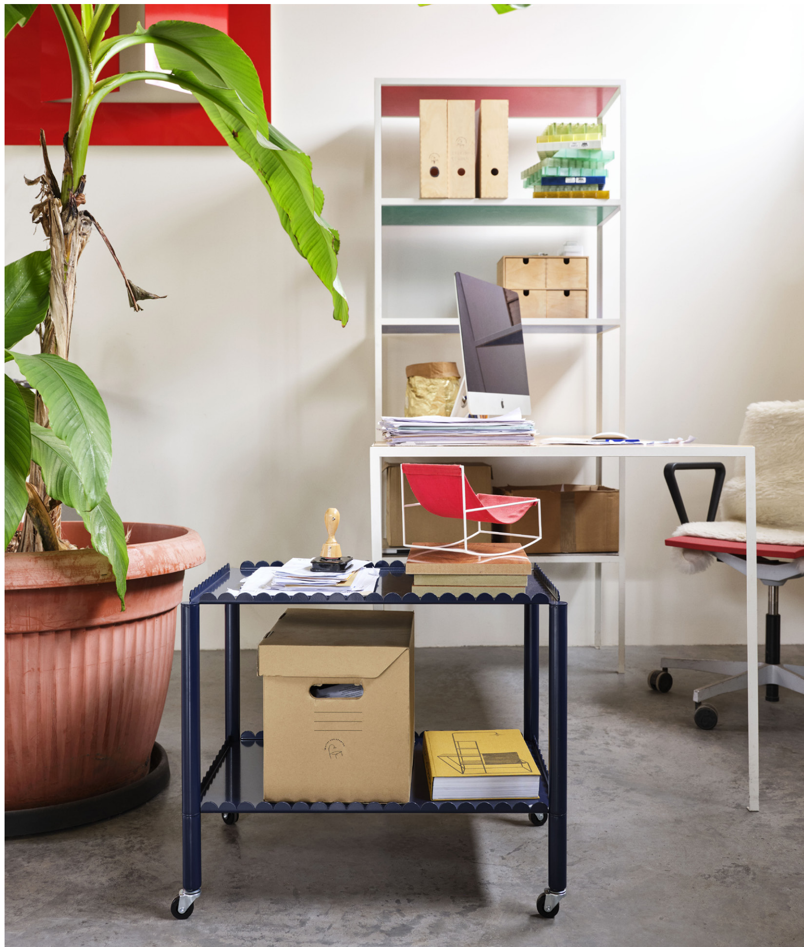
Arcs Trolley Low | Steel blue