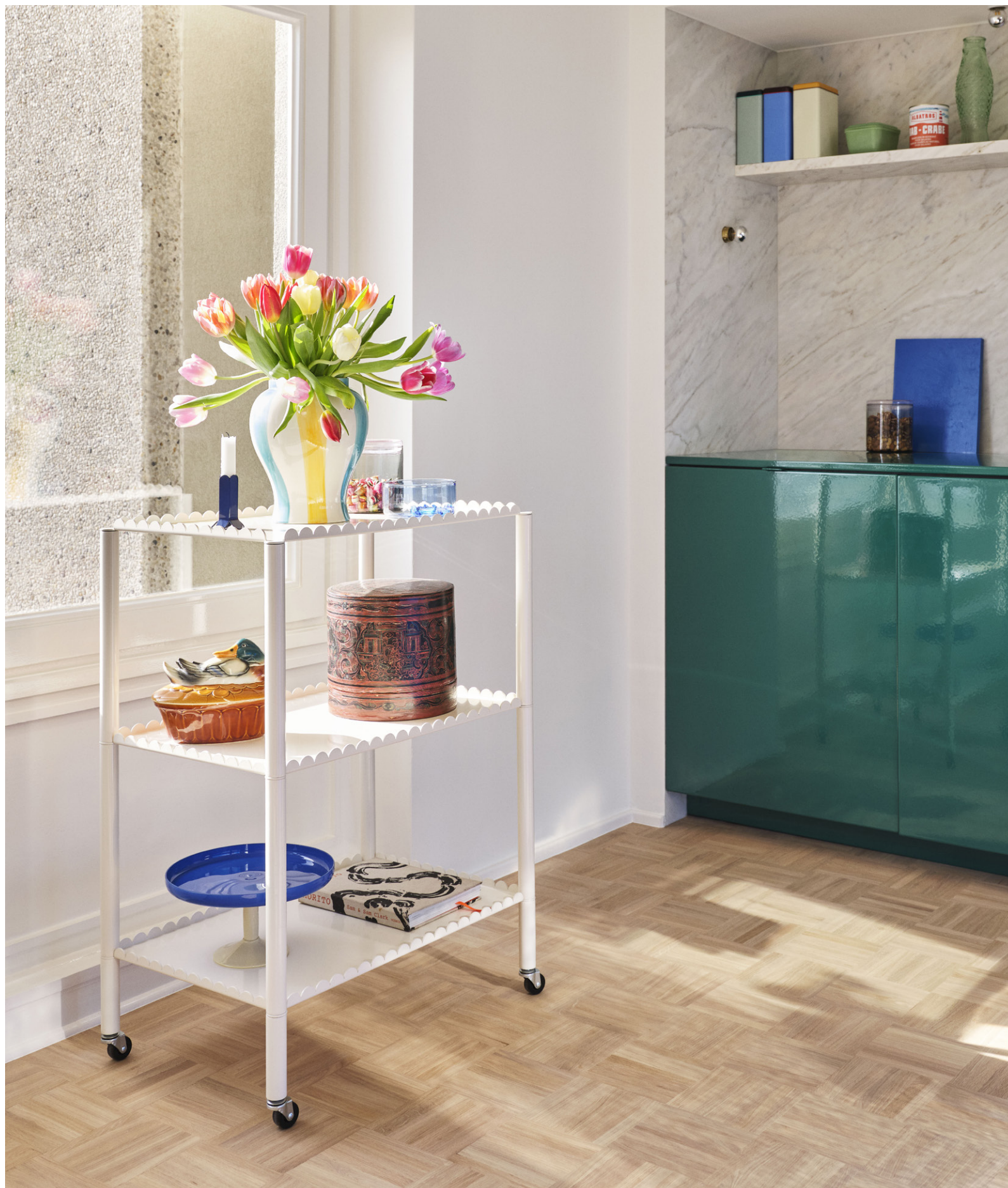
Arcs Trolley High | Eggshell