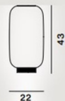
Chouchin 2 Reverse