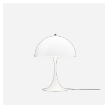
Panthella 320 Table Lamp