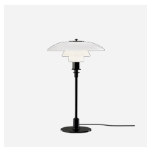
PH 3/2 Table Lamp