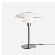
PH 4½-3½ Table Lamp