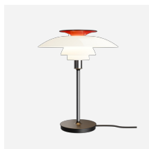
PH 80 Table Lamp