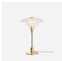
PH 3/2 Pale Rose Table Lamp