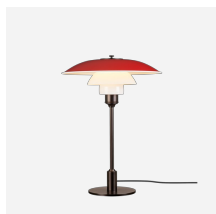
PH 3½-2½ Metal Table Lamp