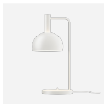
FJ Elements Table Lamp