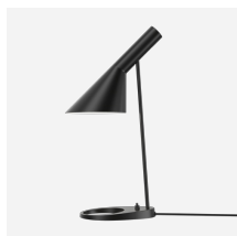
AJ Table Lamp