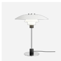
PH 4/3 Table Lamp