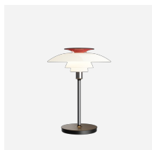
PH 80 Portable Lamp