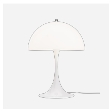
Panthella 400 Table Lamp