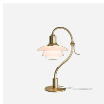
PH 2/2 Question Mark Pale Rose Table Lamp