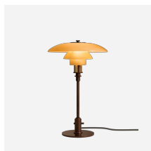
PH 3/2 Aged Brass Table Lamp