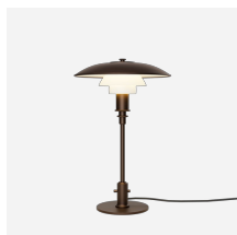
PH 3/2 Aged Brass Opal Table Lamp