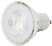
Bulb PHILLIPS MASTER LEDspotMV GU10 5W 2700K 36° 350lm.