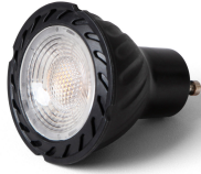
Bulb GU10 LED 5W 2700K 60° black