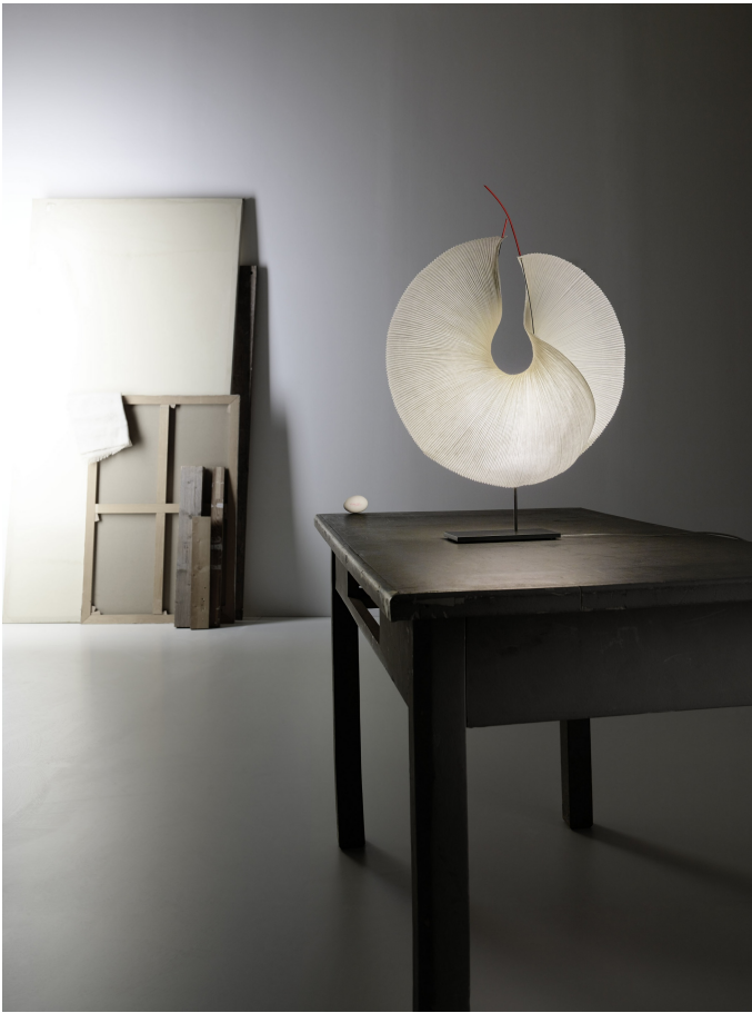
Yoruba Rose DAGMAR MOMBACH, INGO MAURER & TEAM 2017

Paper, metal, stainless steel, silicone. Yoruba Rose is a light object that enchants through perfection and grace. The sheet of paper is almost circularly stretched on light metal wires and strives upwards. The harmonious expression of the model and the extremely pleasant light make it the ideal light source in spaces where one rests. Yoruba Rose can also be produced as a standard lamp on request. Just as in all other MaMo Nouchies, the lampshade consists of Japanese paper, which has to undergo a special manufacturing process in Dagmar Mombach's studio. The light source is an LED module, provided with a cooling element, developed by Ingo Maurer especially for the MaMa Nouchies. The light is warm and soft, and can hardly be distinguished from conventional halogen light. Yoruba Rose is usually available for immediate delivery.