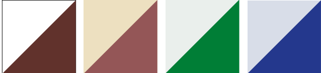
Stand: White Base: Brown Stand: Cream Base: Dark Red Stand: Dusty Green Base: Green Stand: Light Blue Base: Blue