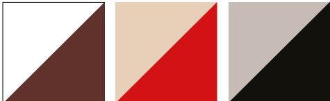
Stand: White Base: Brown Stand: Nude Base: Red Stand: Grey Base: Black