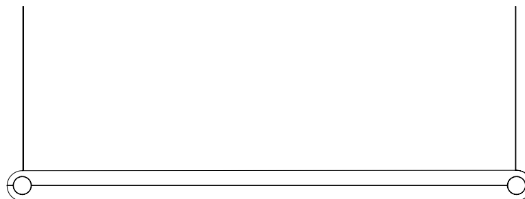
Dim Linear Lamp H: 9 x L: 155,5 x D: 6 cm