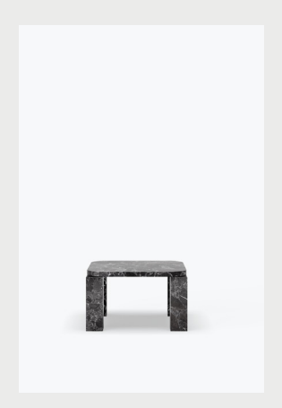
42621 Costa Black Item No: Variant: