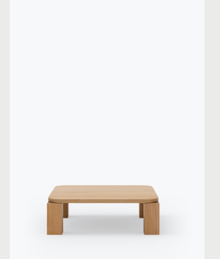
42630 Oak Item No: Variant: