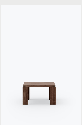
42641 Furned Oak Item No: Variant: