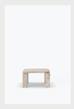
42620 Unfilled Travertine Item No: Variant: