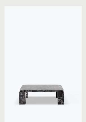
Item No: Variant: 42611 Costa Black