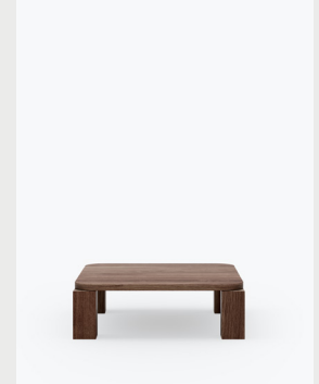
Item No: Variant: 42631 Furned Oak