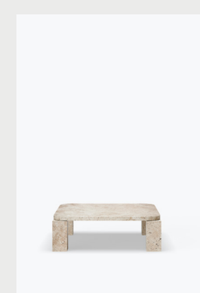
42610 Unfilled Travertive