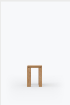
Item No: 42730 Variant: Oak