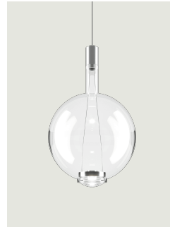
Sky-Fall Round large