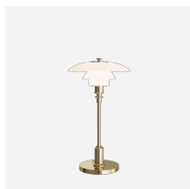
PH 2/1 Portable Lamp