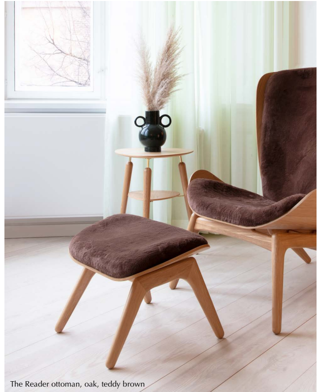
The Reader ottoman, oak, teddy brown