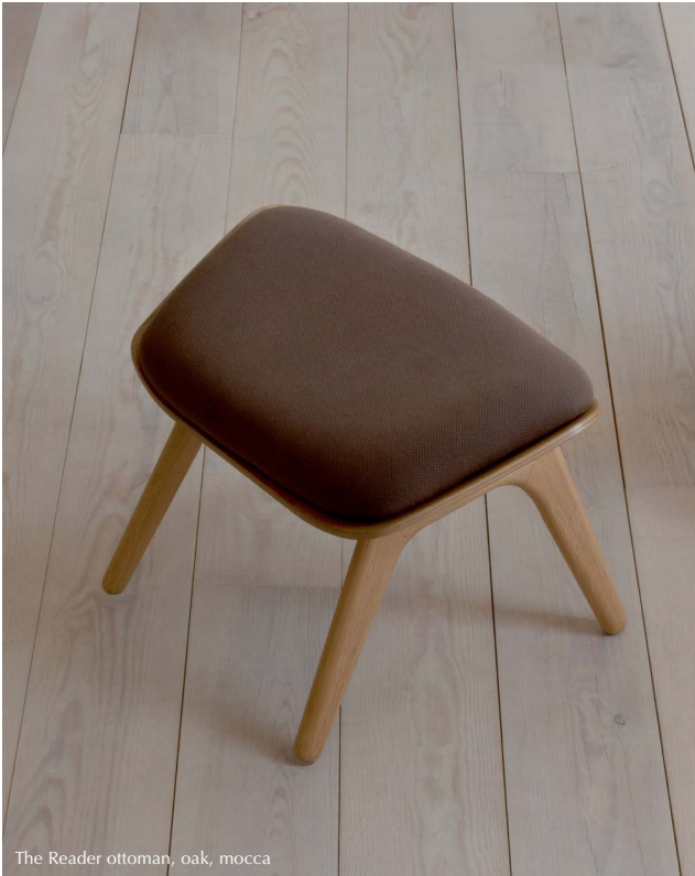
The Reader ottoman, oak, mocca