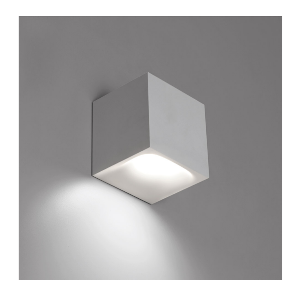
IP20 ( C Dimmerable: +0-